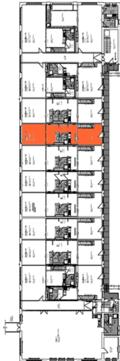
floor plan: first floor with the position of the studio