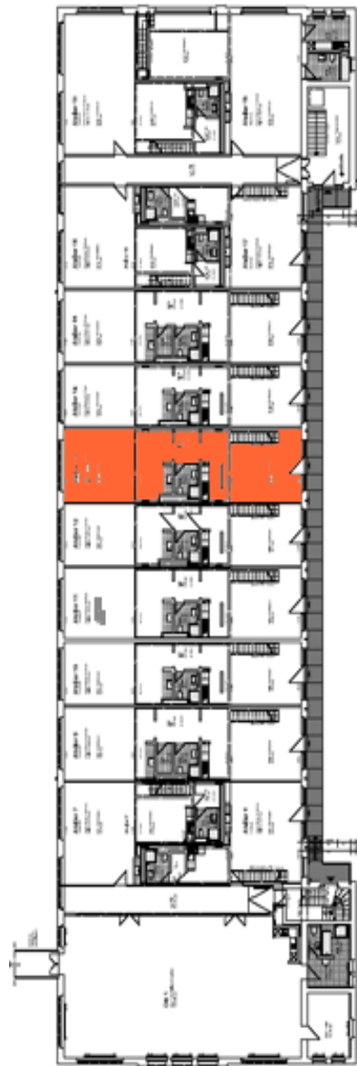
floor plan: first floor with the position of the studio