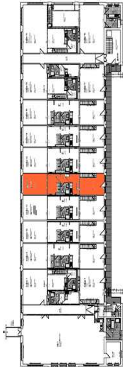
floor plan: first floor with the position of the studio