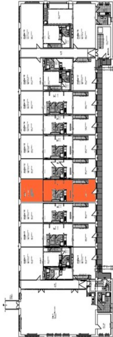
floor plan: first floor with the position of the studio